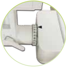
Detector angle adjustable