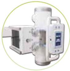
Easy Lock-free mechanics