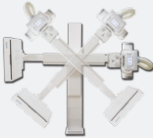
Quick positioning to Chest & Table